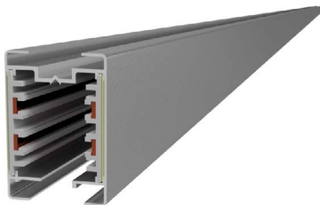
Starline Track Busway 60 Amp Housing

The busway includes an open-access slot, allowing the insertion of customizable plug-in units where desired along the length of the system. This open-access design allowed Hunnell and other Fairground officials to place plug-in units where power was needed without having to power down the system.